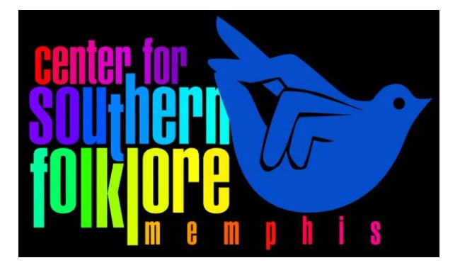
Center for Southern Folklore Stage- Schedule

Contact the CfSF (see below) for the uniquely-Memphis performers scheduled to perform. Center for Southern Folklore 119 S. Main St., Memphis, TN, 38103, phone: (901) 525-3655 E-mail: <u>info@southernfolklore.com</u>, Web: <u>http://www.southernfolklore.com</u> Facebook: <u>https://www.facebook.com/southernfolklore/</u>