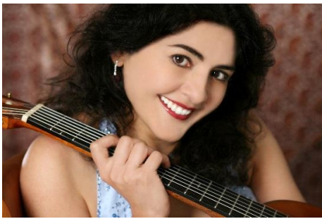
An Evening with Lily Afshar Friday, September 22, 2017, 8pm, $20 for adults, $15 for students