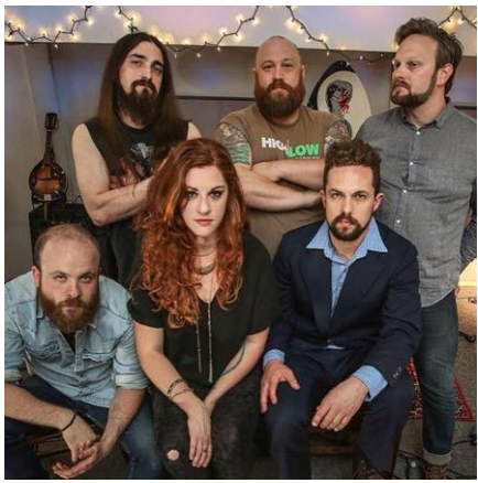
Dead Soldiers Friday, January 5, 2018, 8pm, $15 for adults, $10 for students